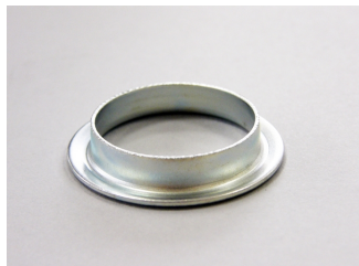
Anello Zincato MEC90